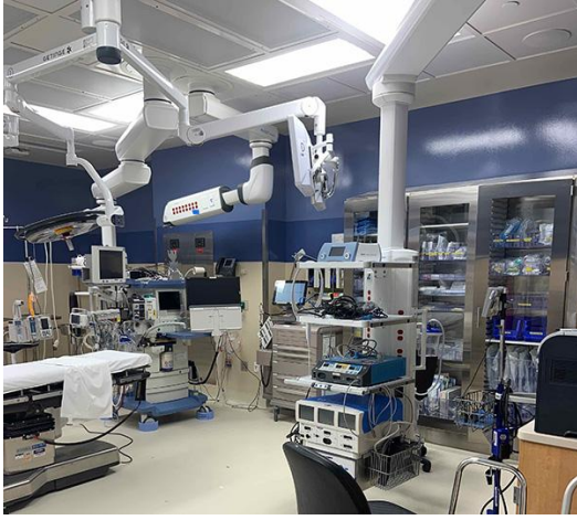
Riley Hospital Operating Room Renovation Indianapolis