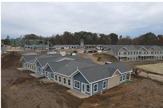
Legacy Living Assisted Living 147,000 SF New Facility Florence, KY