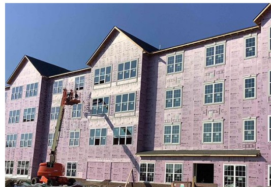
Harmony Assisted Living 204,000 New Facility Avon