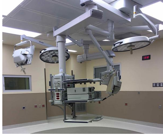
Henry Community Health Operating Room (OR) and Air Handler Unit (AHU) New Castle