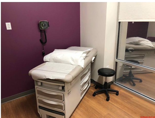
Ascension Medical Group Avon Cardiology Avon